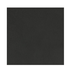
Painted metal Mat lead