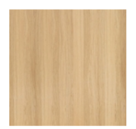
Solid wood Natural ash