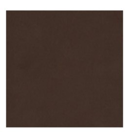
Painted metal Mat bronze