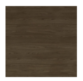
Solid wood Walnut painted ash