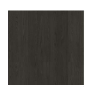
Solid wood Coal ash